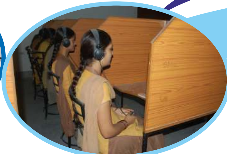
◀ Language Lab.