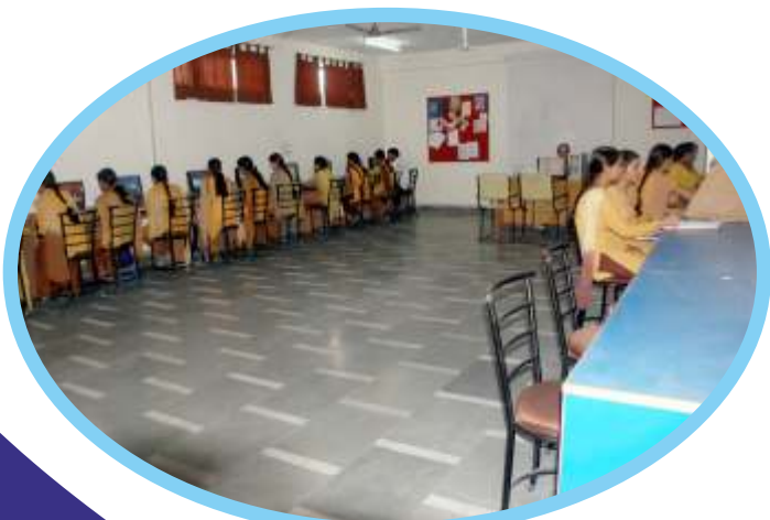
◀ Computer Lab.