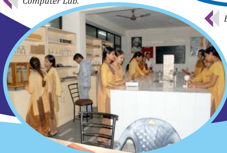
◀ Science Lab.