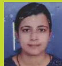
Jyoti NET Qualified (English)