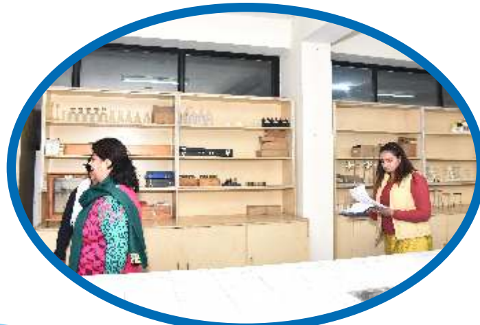
◀ Educational Tech. Lab.