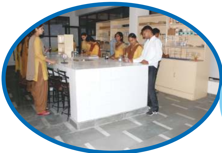
◀ Science Lab