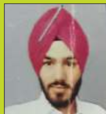
Prince NET Qualified (Commerce)